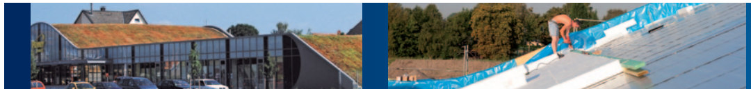
Pure harmony: Rhepanol hg protects the "Penny" supermarket in the town of Werne an der Lippe, Germany