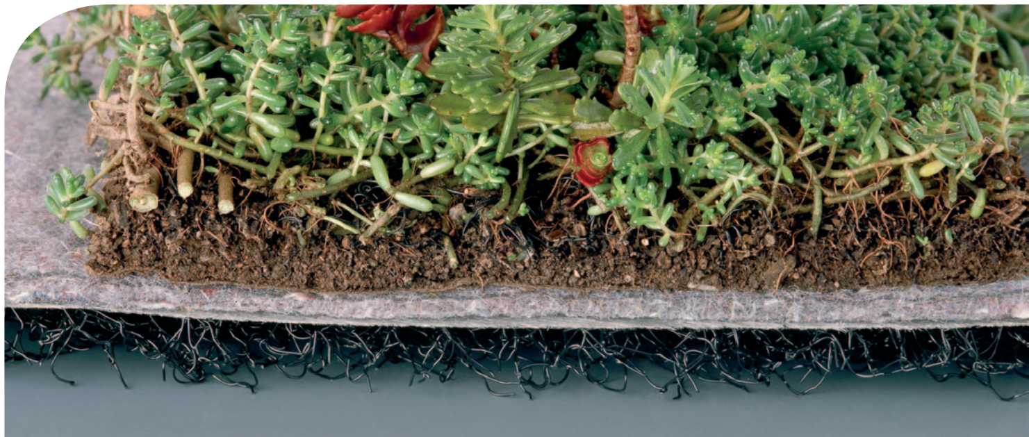
Rhepanol hg used as a base for an extensive green roof.