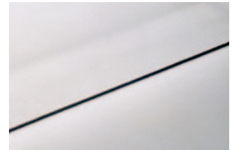
Easy application of Rhepanol hg by hot air welding, without any further sealing.

With Rhepanol hg , designers, landscape architects and installers find even more benefits from the Rhepanol quality mark. This solution meets the demands of our times. Principals, investors and house owners are ever more eager to have green roof areas. Along with aesthetic and ecological advantages, a green roof is a convincing alternative in particular with respect to economic aspects. So it is no longer a secret, but rather common understanding that planted roof coverings have a significantly longer service life due to the protection against UV radiation, temperature extremes, hailstorms and encrustation.