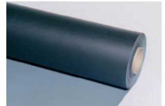
Rhepanol hg. Roof sealing and root penetration protection in one single membrane.

What is so special about Rhepanol hg ? Well it is designed to meet the criteria laid out in the FLL Guideline for resistance to root penetration. As to its ingredients, this roofing membrane is also based on the long-term proven material polyisobutylene (PIB), as has already been the case with Rhepanol fk for 30 years. The difference, however, why progressing and even persistently boring root systems will despair of Rhepanol hg , lies elsewhere. Rhepanol hg is optimised in terms of resistance to root penetration and hot air welding characteristics. That is why the seams are also absolutely resistant to root penetration without any further sealing. And this is exactly what the "h" stands for in the name. The "g" means the stabilisation of the roofing membrane by the central glass fleece reinforcement.